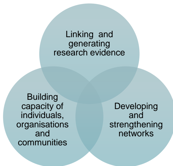
Figure 1. Program Streams in the Locational Disadvantage Program